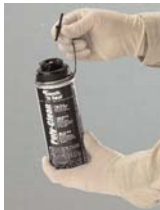
Remove adapter and attach to top of can for easy use.