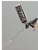
Attach can to gun basket to remove foam from gun barrel.