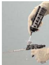
Spray cleaner directly on top of gun for foam removal.